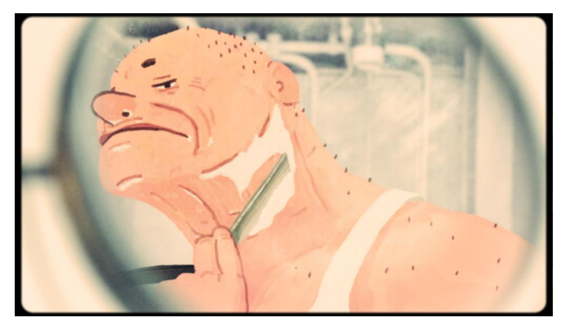
The Flying Sailor

Only two other films in 2022 have crossed the billion dollar mark, Top Gun: Maverick and Jurassic World Dominion . In 2019 nine movies crossed the $1 billion mark worldwide so while the industry is recovering, it still has a long way to go.