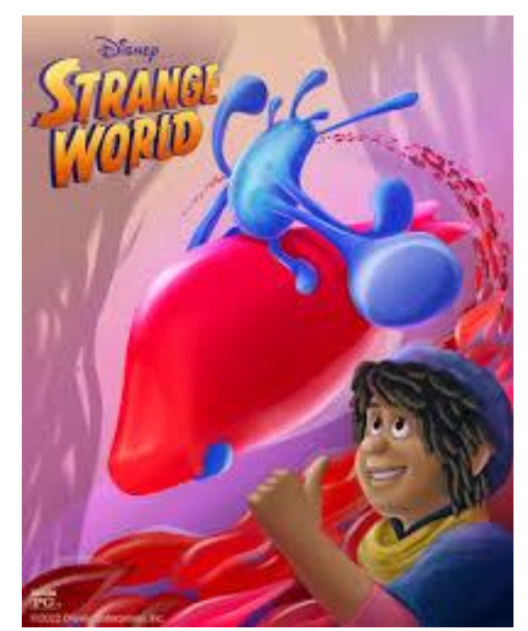
DISNEY'S 'STRANGE WORLD.' WAS A BOX OFFICE DISASTER While Black Panther was a smash it, Strange World was called a failure that would lose millions. The press lost no time in proclaiming it a disaster as it had the worst Thanksgiving opening in modern times in the US. It also bombed overseas. In the first five days it only brought in $28 million for a film that cost $180 million before marketing. The 2<sup>nd</sup> weekend it only grossed about $5 million. It could lose over $100 million.

While saying that he has hope for a cessation in violence, thanks to the work of organizations such as the Sandy Hook Promise, as well as the passage of President Joe Biden's recent gun violence legislation, Obama still finds himself getting angry snd he urged others to use that anger to act. He also recited the names of those killed.