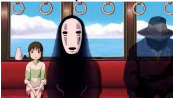
THE FIRST TIME FOR ANIMATED FEATURES ARE INCLUDE IN 'SIGHT AND SOUND' MAGAZINE'S LIST OF THE TOP 100 FILMS OF ALL TIME The distinguished films are two by Hayao Miyazaki, My Neighbor Totoro (1988) is number 74 and Spirited Away is 75. This is an t acknowledgment that animation is an important art. The poll has been conducted since 1952, once a decade by the British film magazine. Roger Ebert once described the survey as "by far the most respected of the countless polls of great movies, the only one most serious movie people take seriously."