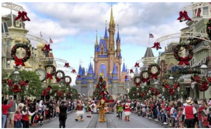
Crowds watch characters parade at Magic Kingdom in Lake Buena Vista, Florida.

WORKERS AT THE HAPPIEST PLACE ON EARTH ARE ONCE AGAIN COMPLAINING THEY ARE GROSSLY UNDER PAID There are about 70,000 employees at Disney World, the largest single site employer in the US. It is also the world's largest theme park. Workers are pushing for better wages in the contract that is up for renewal.