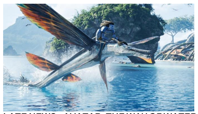
LATE NEWS: AVATAR: THE WAY OF WATER crossed the billion dollar mark before New Year'

Eve. A critic on NPR said the motion-capture animation bothered her as it looked like it was stuck in the uncanny valley. Other critics complained of too many violent wars and the film was too long. It has also been accused of being a movie in search of a plot. Everyone seems to agree the special effect are its greatest asset.